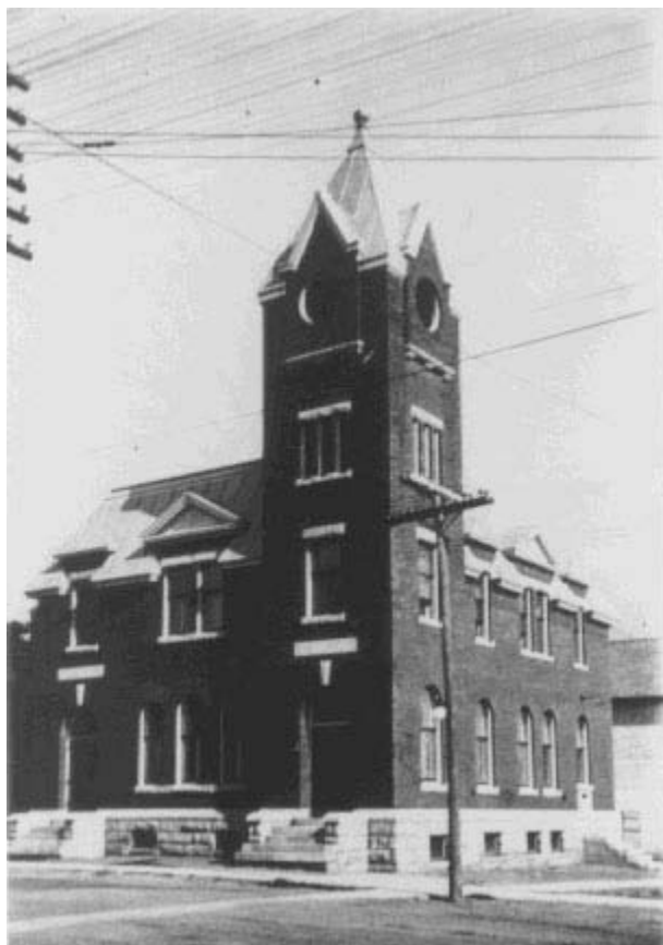
Acton Government Building 1913